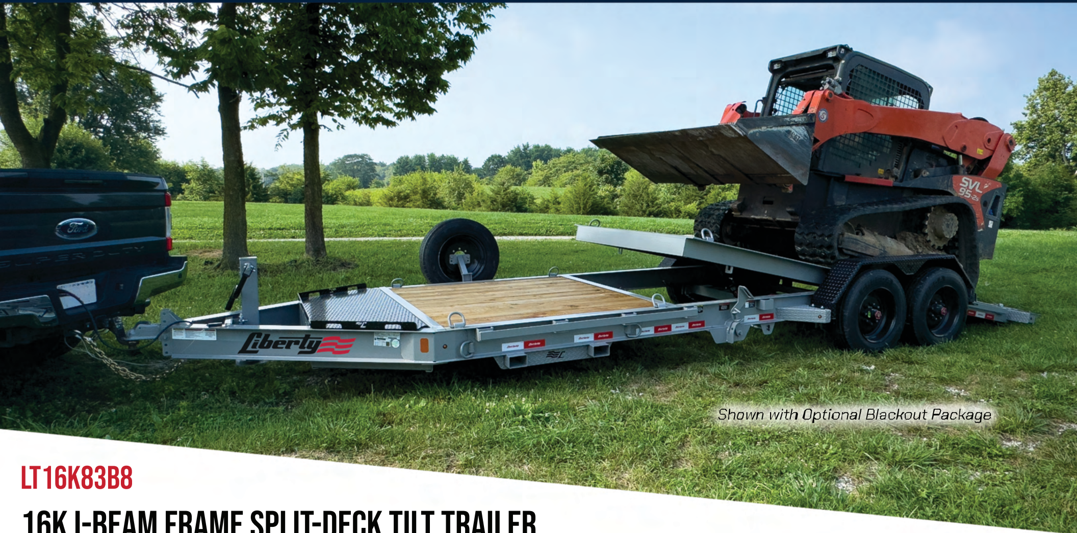
Shown with Optional Blackout Package