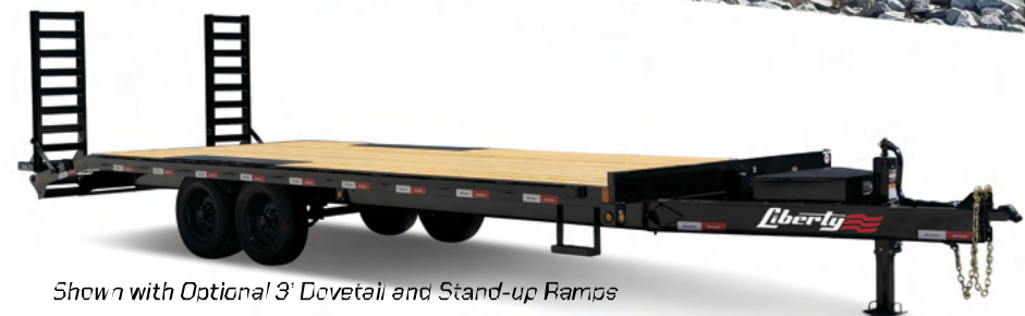
Shown with Optional 3' Dovetail and Stand-up Ramps

The Liberty LOA16K102B8 is a strong and capable deckover equipment trailer with a 17,500 lb GVWR, designed for hauling everything from palletized materials to compact equipment. Its 8" I-beam mainframe ensures lasting durability, while the included 72" rear slide-in ramp package adds versatility for loading equipment. Additional features like the convenient toolbox and Fortress Oil Caps for superior bearing protection make this trailer a reliable and efficient choice for demanding jobs.